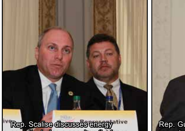
Rep. Scalise discusses energy security during a panel on the issue.