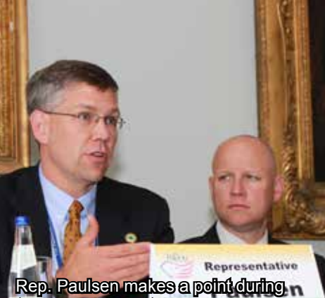
Rep. Paulsen makes a point during the panel on health care.