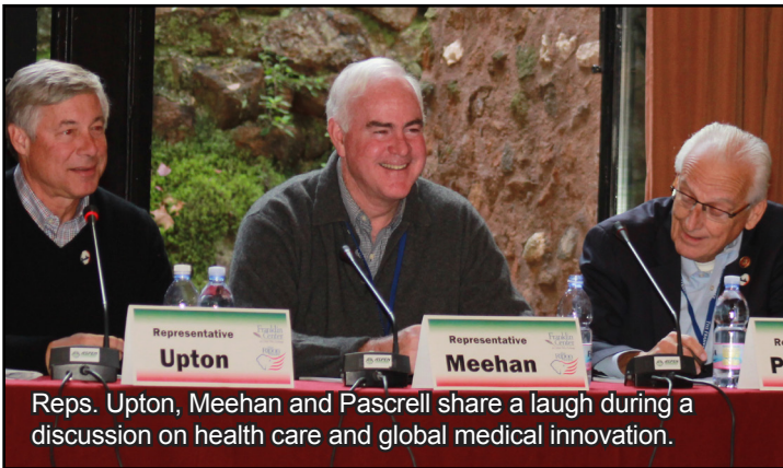
Reps. Upton, Meehan and Pascrell share a laugh during a discussion on health care and global medical innovation.