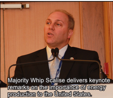
Majority Whip Scalise delivers keynote remarks on the importance of energy production to the United States.