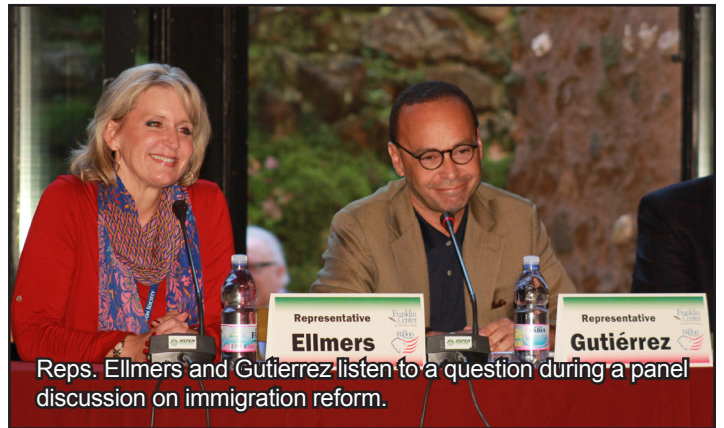
Reps. Ellmers and Gutierrez listen to a question during a panel discussion on immigration reform.