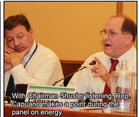
With Chairman Shuster listening, Rep. Capuano makes a point during the panel on energy.