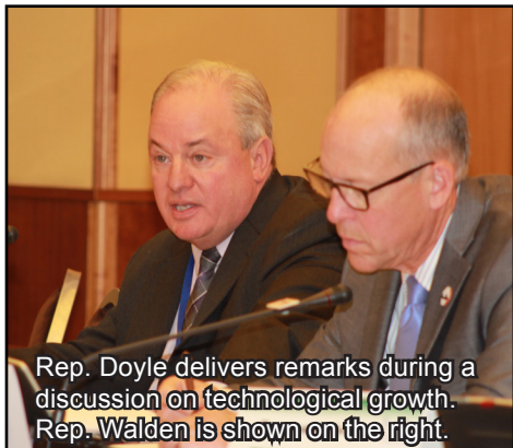
Rep. Doyle delivers remarks during a discussion on technological growth. Rep. Walden is shown on the right.