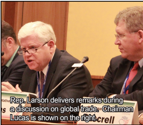
Rep. Larson delivers remarks during a discussion on global trade. Chairman Lucas is shown on the right.