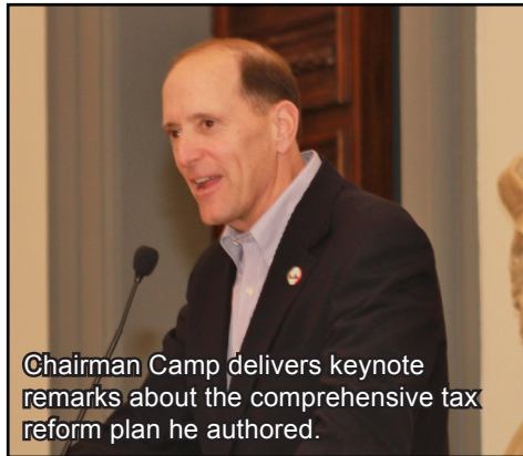
Chairman Camp delivers keynote remarks about the comprehensive tax reform plan he authored.