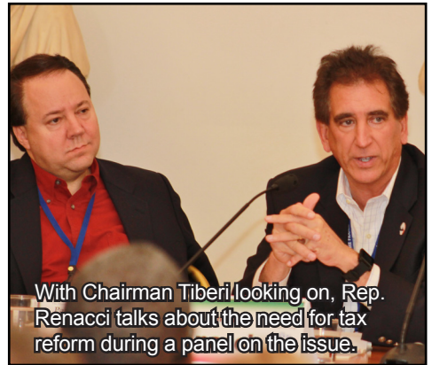
With Chairman Tiberi looking on, Rep. Renacci talks about the need for tax reform during a panel on the issue.