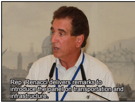
Rep. Renacci delivers remarks to introduce the panel on transportation and infrastructure.