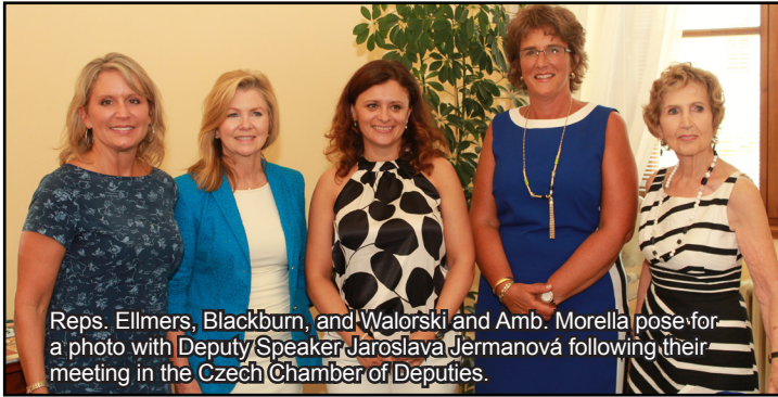
Reps. Ellmers, Blackburn, and Walorski and Amb. Morella pose for a photo with Deputy Speaker Jaroslava Jermanová following their meeting in the Czech Chamber of Deputies.