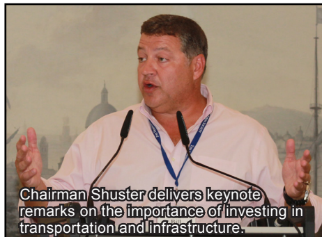
Chairman Shuster delivers keynote remarks on the importance of investing in transportation and infrastructure.