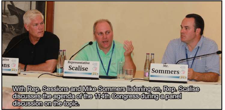
With Rep. Sessions and Mike Sommers listening on, Rep. Scalise discusses the agenda of the 114th Congress during a panel discussion on the topic.