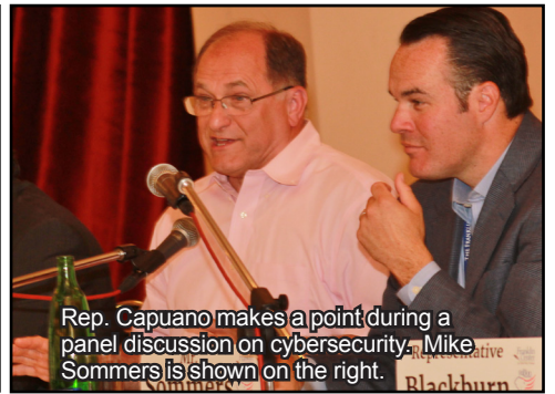
Rep. Capuano makes a point during a panel discussion on cybersecurity. Mike Sommers is shown on the right.