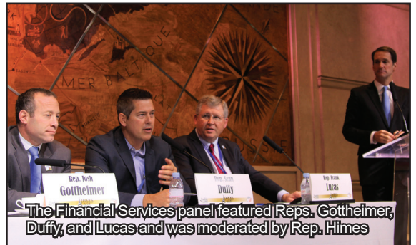
The Financial Services panel featured Reps. Gottheimer, Duffy, and Lucas and was moderated by Rep. Himes