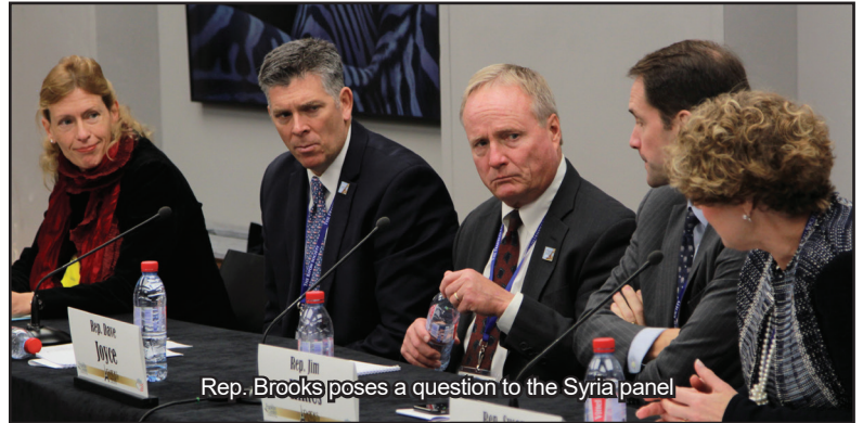
Rep. Brooks poses a question to the Syria panel