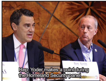
Rep. Yoder makes a point during the Homeland Security panel