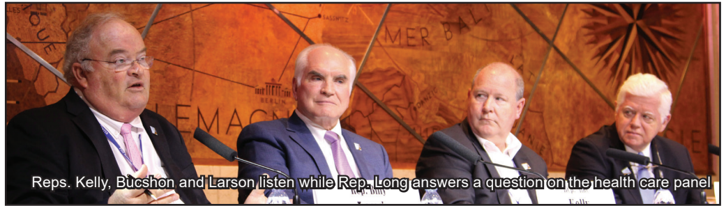
Reps. Kelly, Bucshon and Larson listen while Rep. Long answers a question on the health care panel