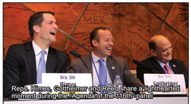
Reps. Himes, Gottheimer and Reed share a lighthearted moment during the "Agenda of the 116th" panel