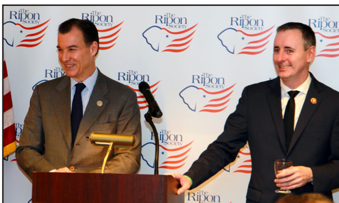
Bipartisanship was the focus of yesterday's discussion.