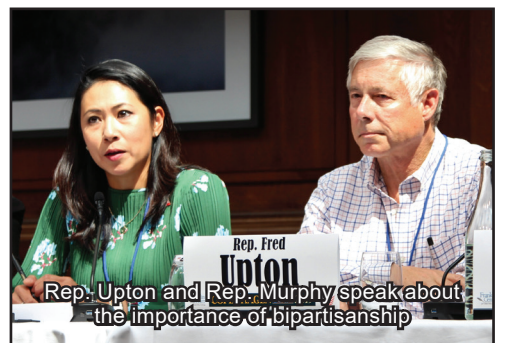
Rep. Upton and Rep. Murphy speak about the importance of bipartisanship