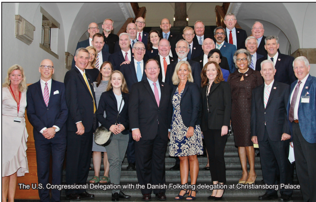
The U.S. Congressional Delegation with the Danish Folketing delegation at Christiansborg Palace