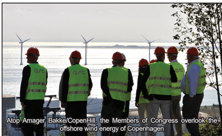
Atop Amager Bakke/CopenHill, the Members of Congress overlook the offshore wind energy of Copenhagen

“Over the years, the Danes and Americans have been at each other’s side in both good times and bad. We were there for them during the liberation of Europe in World War II. And they were there for us following the dark days of September 11th in 2001.”