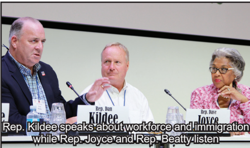
Rep. Kildee speaks about workforce and immigration while Rep. Joyce and Rep. Beatty listen