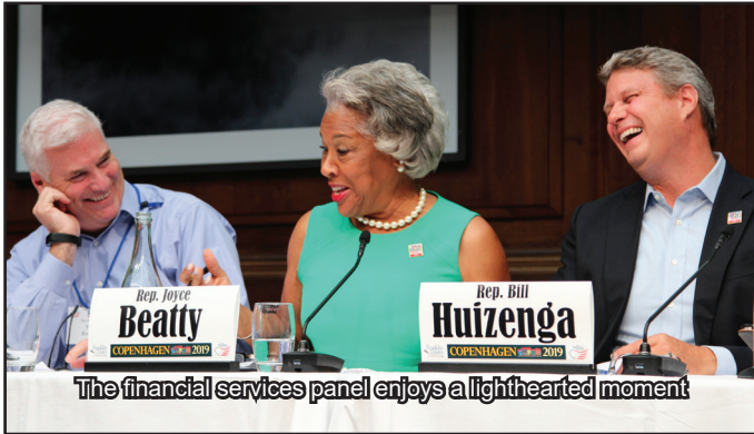
The financial services panel enjoys a lighthearted moment