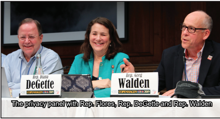
The privacy panel with Rep. Flores, Rep. DeGette and Rep. Walden