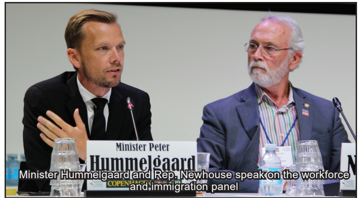
Minister Hummelgaard and Rep. Newhouse speak on the workforce and immigration panel

to the pros and cons of Denmark's almost entirely single payer, decentralized health care system which is managed through administrative regions and municipalities. The panel discussed how both countries are working to improve their health care delivery, patient out-comes and effectiveness of care.