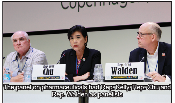
The panel on pharmaceuticals had Rep. Kelly, Rep. Chu and Rep. Walden as panelists