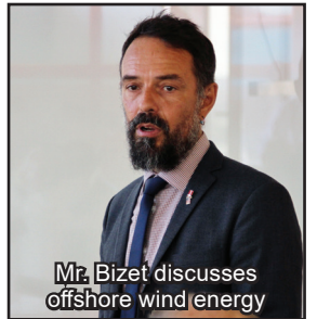
Mr. Bizet discusses offshore wind energy