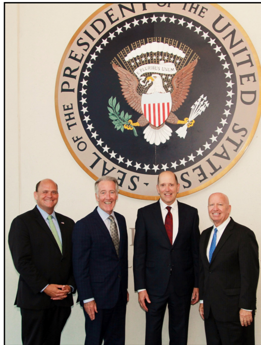
Reed, Neal, Camp and Brady were presented with the 2019 Roosevelt Leadership Award at the John F. Kennedy Presidential Library in Boston on September 12th.