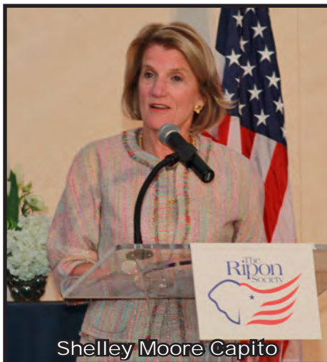
Shelley Moore Capito