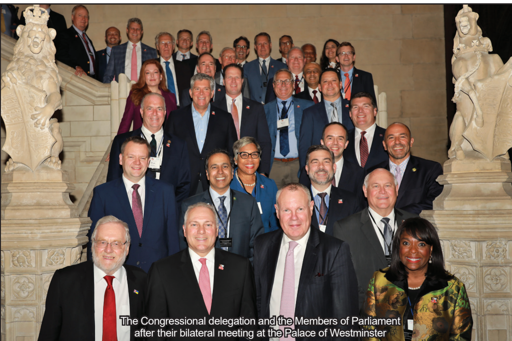
The Congressional delegation and the Members of Parliament after their bilateral meeting at the Palace of Westminster