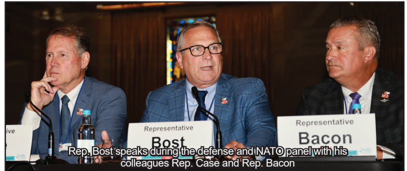
Rep. Bost speaks during the defense and NATO panel with his colleagues Rep. Case and Rep. Bacon