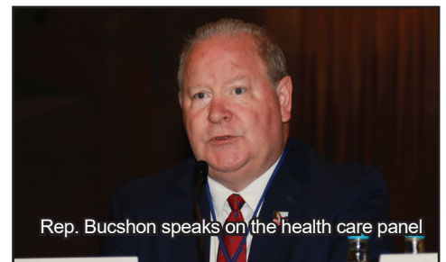
Rep. Bucshon speaks on the health care panel