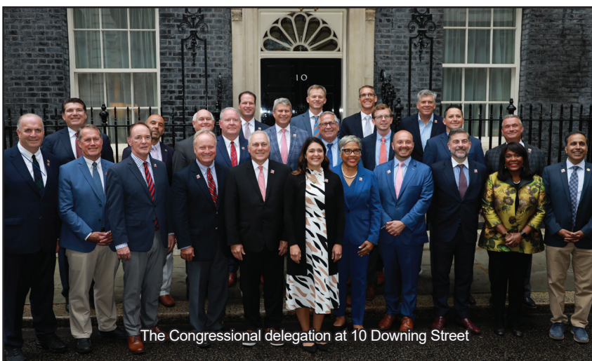
The Congressional delegation at 10 Downing Street

“With China on the rise and Russia once again a threat, the Special Relationship between the U.S. and UK has never been more important.”