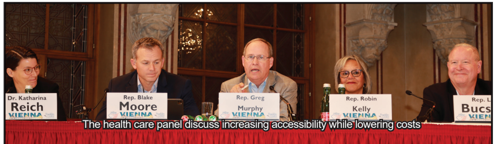
The health care panel discuss increasing accessibility while lowering costs