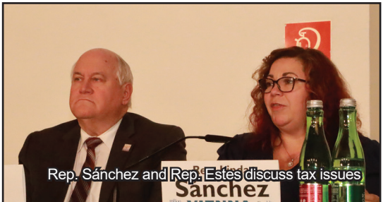
Rep. Sánchez and Rep. Estes discuss tax issues