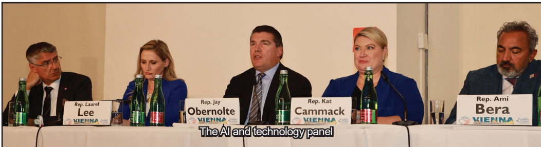
The AI and technology panel