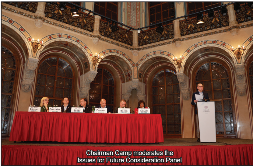
Chairman Camp moderates the Issues for Future Consideration Panel