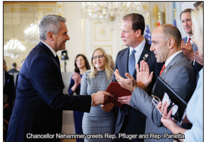
Chancellor Nehammer greets Rep. Pfluger and Rep. Panetta

The Congressional delegation participated in a number of high-level meetings and briefings including a bilateral meeting with Chancellor Karl Nehammer, the Federal Chancellor of the Republic of Austria. Occurring on Monday at the Chancellery, also participating in the meeting was Mr.