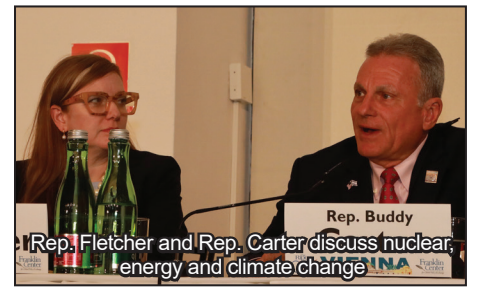
Rep. Fletcher and Rep. Carter discuss nuclear energy and climate change